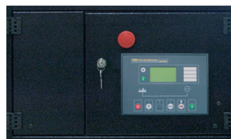
Deep Sea 7210 Control Panel