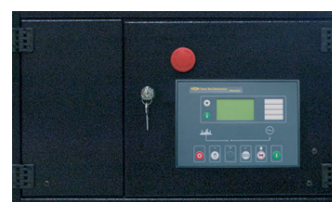
Deep Sea 7510 Loadshare Control Panel